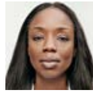
Nadine Burke Harris Center for Youth Wellness