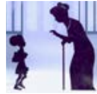
"Miss Kendra" Curriculum Center